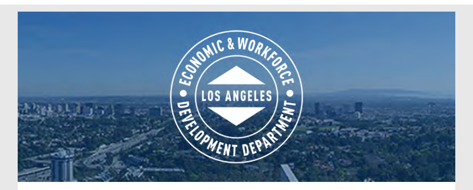
Economic & Workforce Development Department (EWDD) Weekly Updates NEWS FOR THE WEEK OF AUGUST 2, 2021